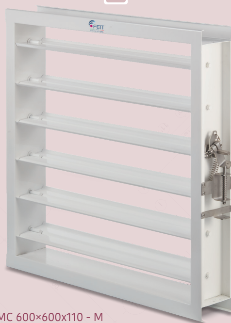
EMC 600×600×110 - M