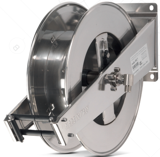
AUTOMATIC INOX HOSE REEL