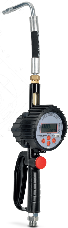
OIL DISPENSING NOZZLE