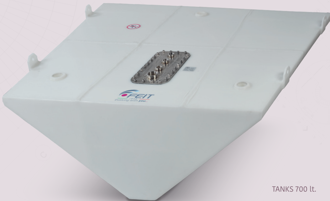
TANKS 700 lt.