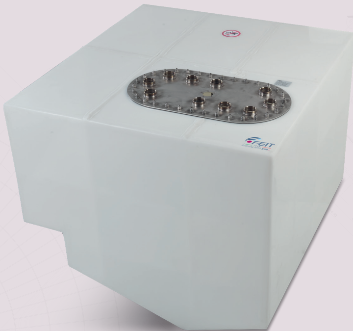
TANKS 929 lt.